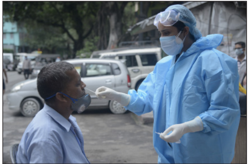
COVID test being conducted.