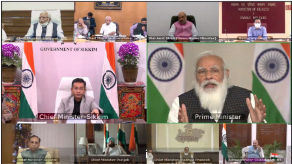
High Level virtual meeting on COVID -19 with Prime Minister of India