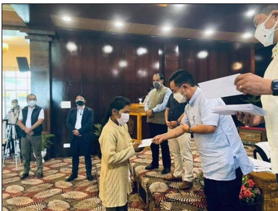
Chief Minister Mr. Prem Singh Tamang presenting Appointment Orders to Health Care Volunteers