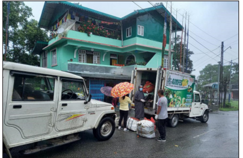
SIMFED vans delivering essential commodities