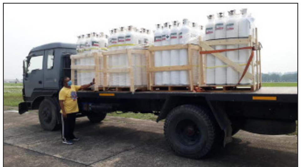
Oxygen Cylinders being brought to the State