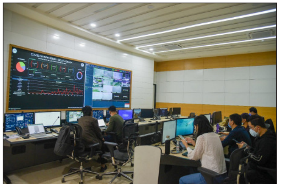
War Room in Namchi