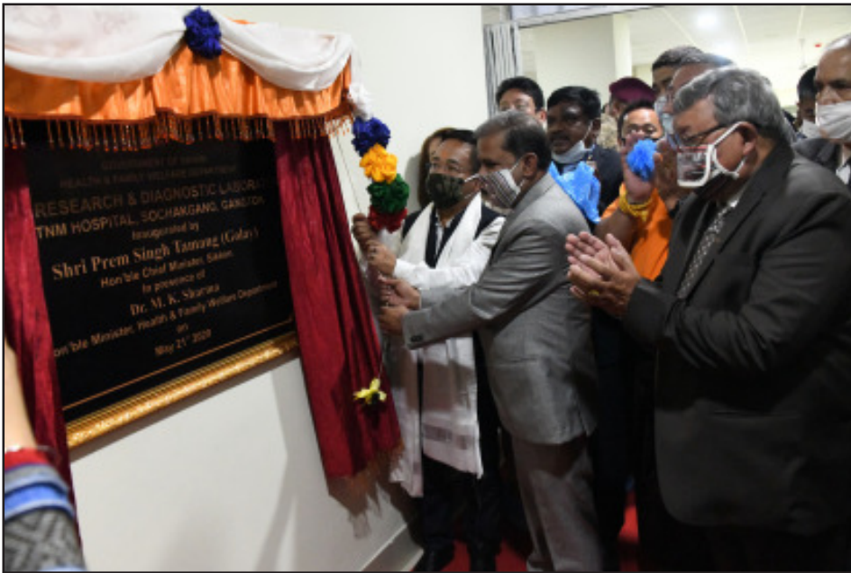
Chief Minister Mr. Prem Singh Tamnag unveiling the plaque of Viral lab at STNM.