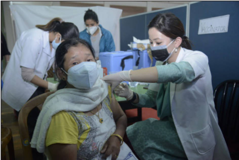
Citizen receiving COVID vaccination