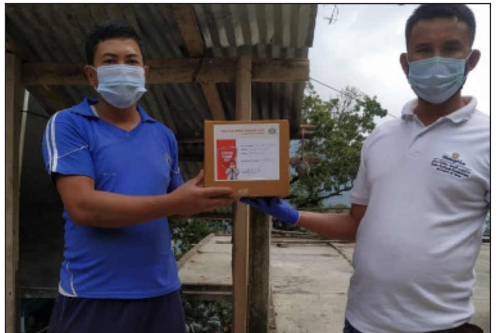
COVID Care Kit being handed over