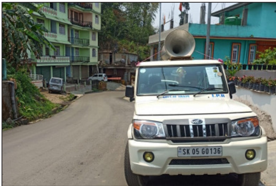
Miking for COVID awareness