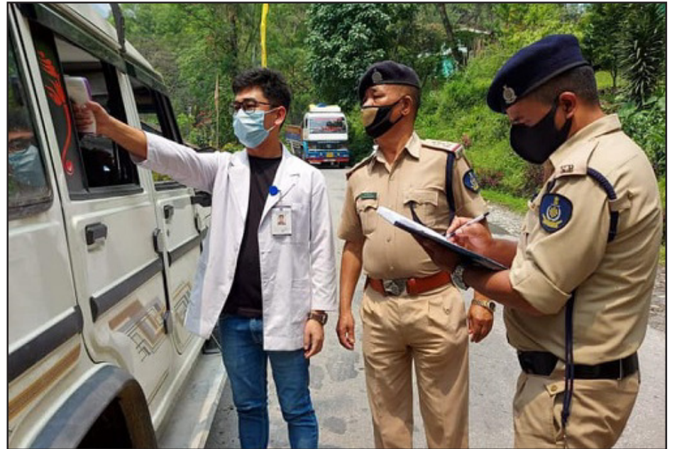
Thermal Screening being conducted