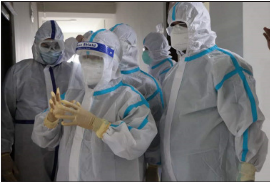
Chief Minister Mr. Prem Singh Tamang visiting COVID Unit