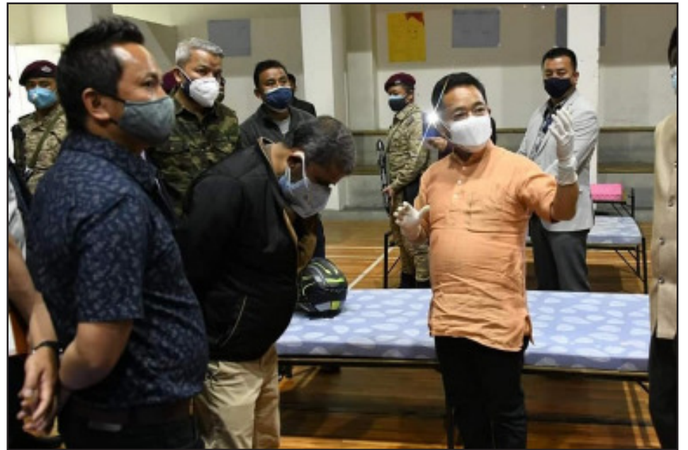
Chief Minister Mr. Prem Singh Tamang inspecting COVID Care Centres