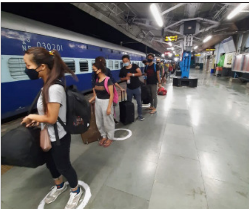
Sikkimese people being brought back home from various places