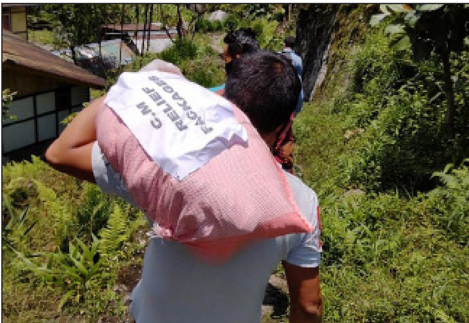
Chief Minister's Relief packages being distributed