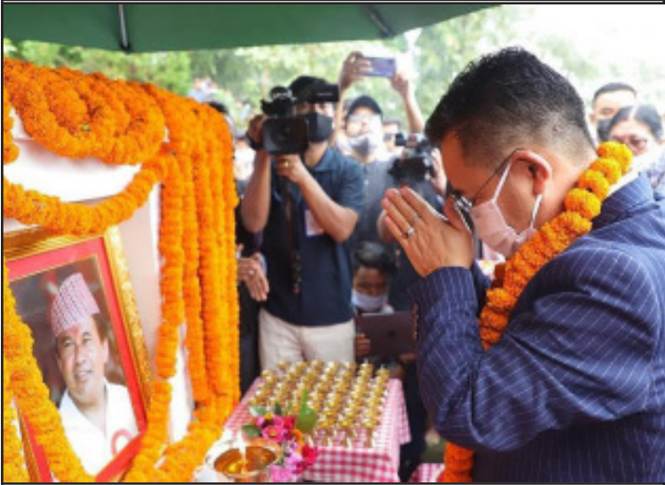
Chief Minister Mr. Prem Singh Tamang paying a tribute to the former Chief Minister Late Nar Bahadur Bhandari on his 81st birth anniversary at his birth place in Malbaisey, West Sikkim on October 05.